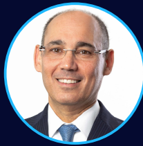
Prof. Amir Yaron, Bank of Israel Governor